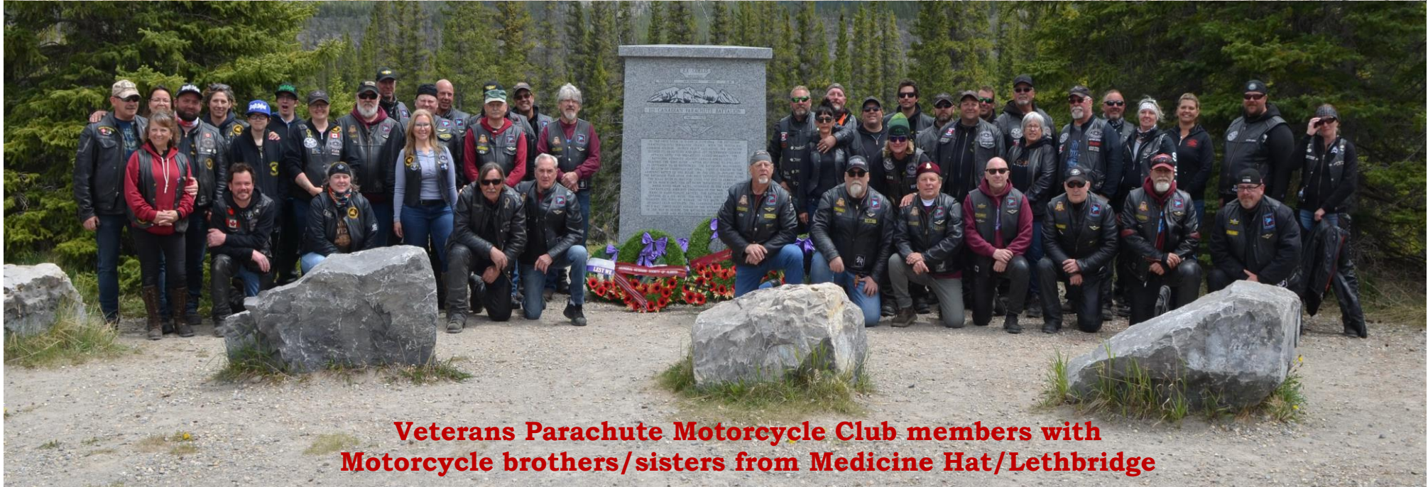
Veterans Parachute Motorcycle Club members with Motorcycle brothers/sisters from Medicine Hat/Lethbridge