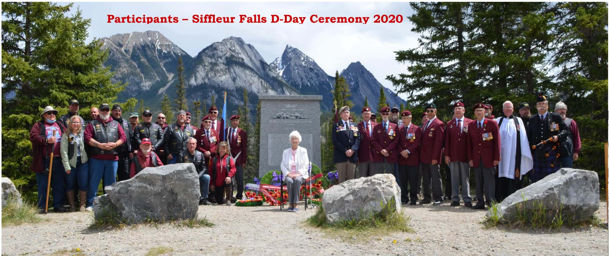
Participants – Siffleur Falls D-Day Ceremony 2020