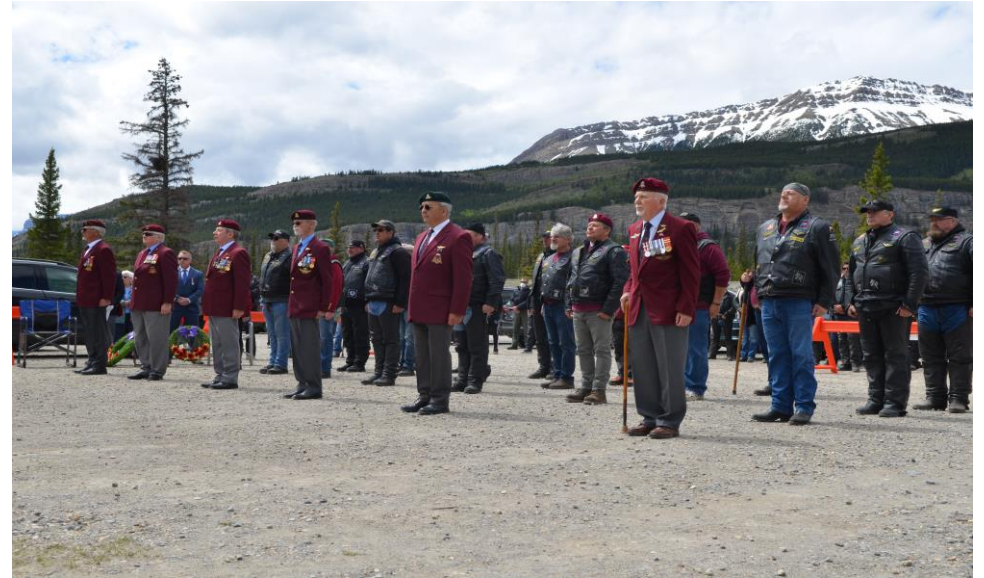
Parade formed in "social distancing" formation