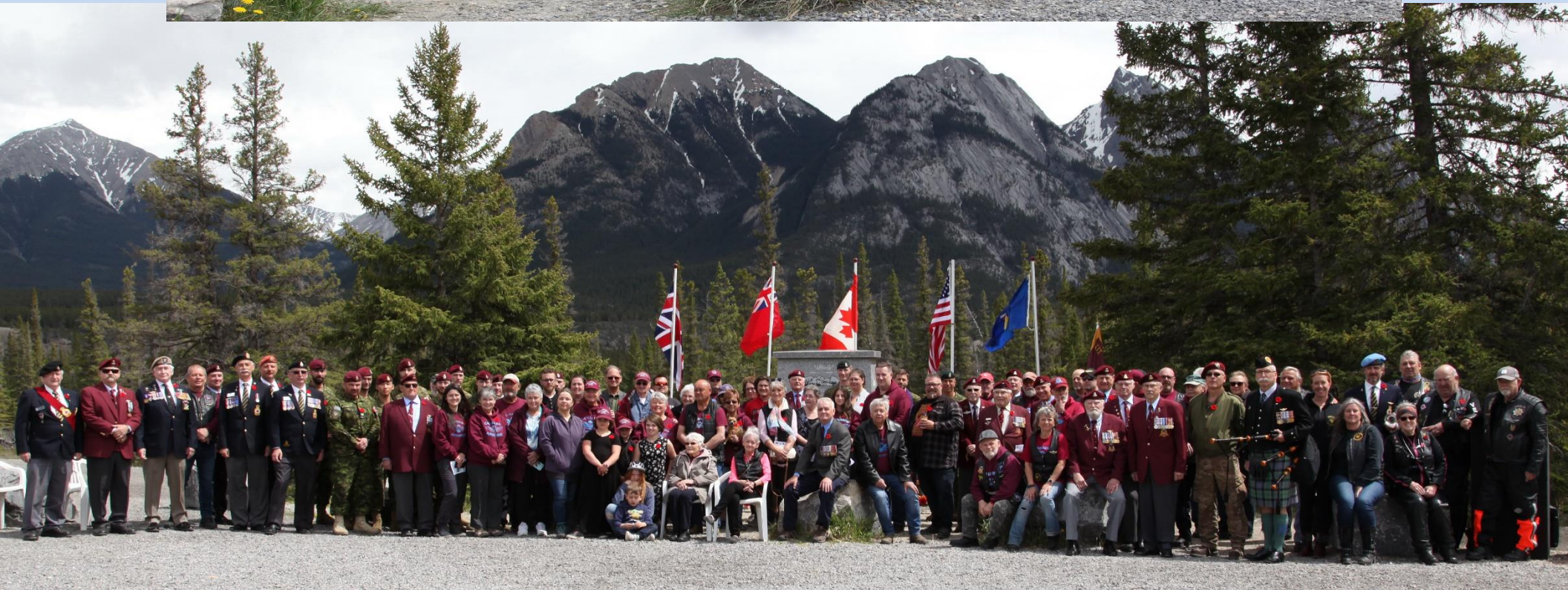
D-DAY CEREMONY SIFFEUR FALLS, ALBERTA - JUNE 6 TH , 2022