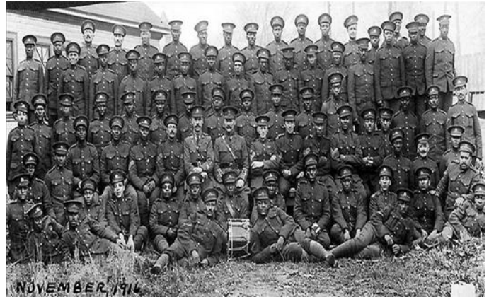
(Members of No. 2 Construction Battalion)

It was only after two years and the hard work of Black community leaders to challenge the racist and discriminatory recruitment policies, that No. 2 Construction Battalion was formed. The battalion played an invaluable role in the war by supplying critical lumber to the trenches and railways.