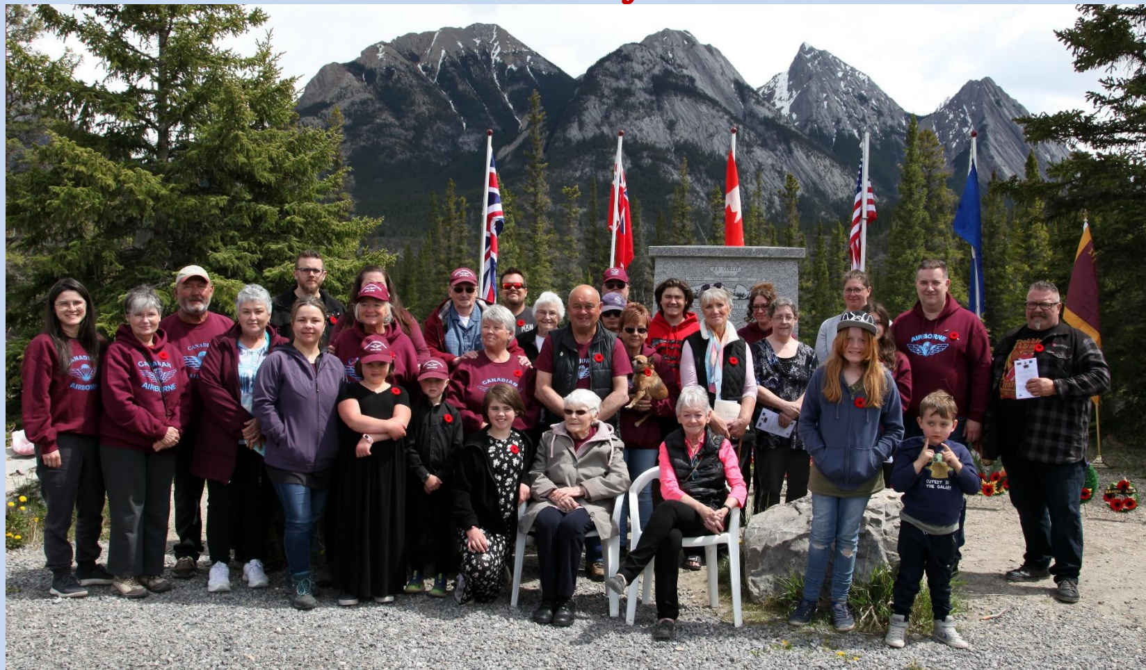
Family members of "The Guardians"