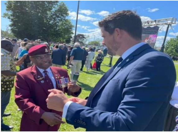
Taking with Sean Fraser, MP Central Nova

My trip to Nova Scotia was two-fold, to visit family and to attend the federal government's formal apology to descendants and relatives of the men of the No. 2 Construction Battalion (The Black Battalion), 106 years after the formation of the historic battalion that faced anti-Black racism during the First World War, a long unknown segment of our Canadian military history to many a Canadian.